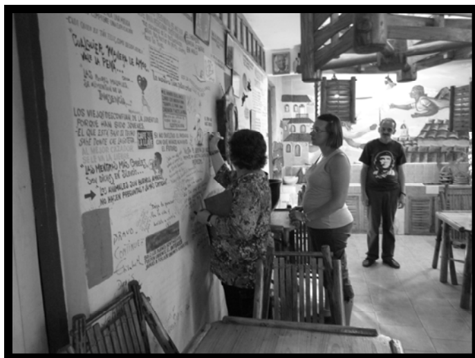
West Virginia teachers signing the friendship wall at the children's center