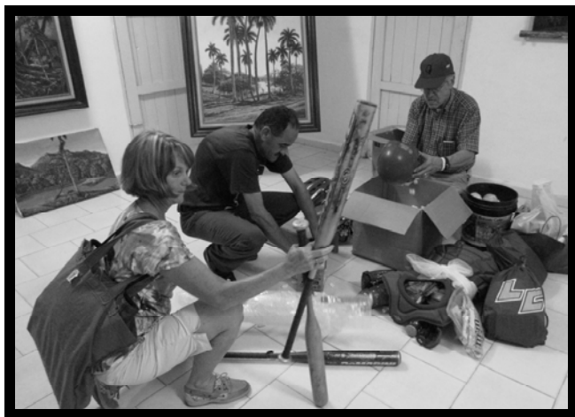
Patio Pellegrino, community project for underprivileged children

The participants acquired resources relating to the teaching of Cuban history, politics, education, culture, and economics. The tour was led by experienced guides – both American and