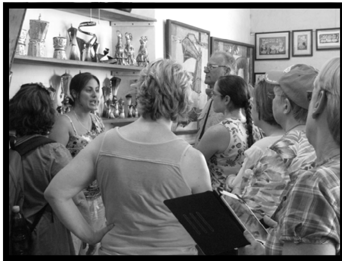
Visit to the art gallery, La Casa de los Conspiradores