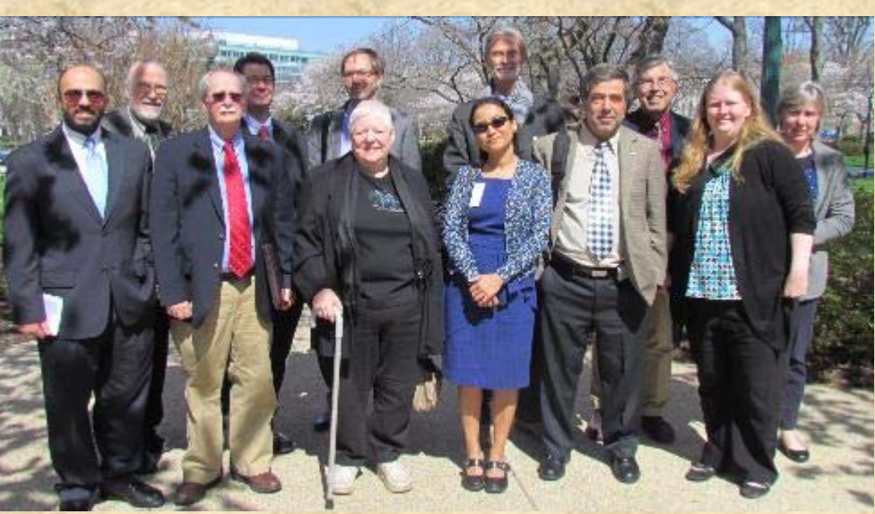
2014 Scholar-Diplomat Program Participants

Faculty who have participated in the Scholar-Diplomat Program remark on the quality of programming and the opportunity to learn from people directly involved in making and carrying out policy. New faculty are always encouraged to apply. Faculty who have not attended before, but who demonstrate that they can use the material in their classes, are especially encouraged to apply.