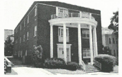
WVU International House

The Spruce House at 544 Spruce St. is being transformed into WVU’s new International House, a multicultural community for 37 undergraduate students – 17 females and 20 males – from around the world.