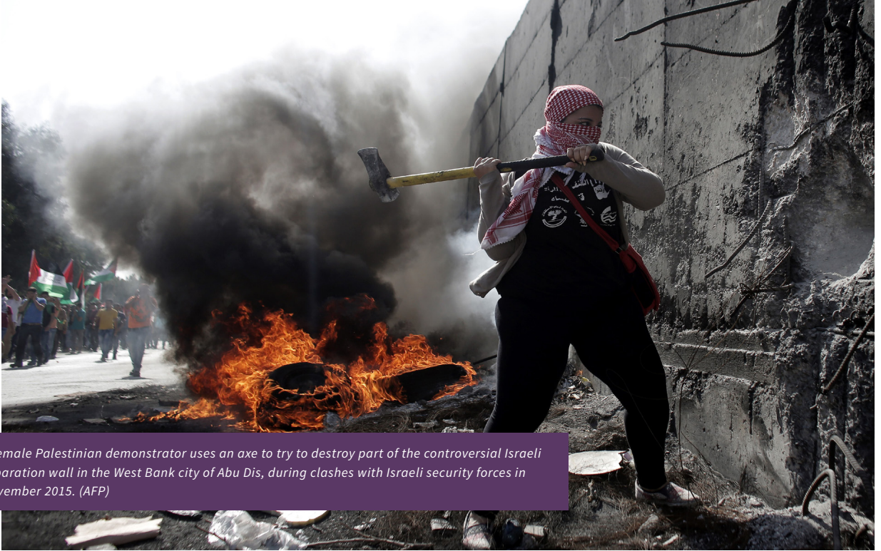
A female Palestinian demonstrator uses an axe to try to destroy part of the controversial Israeli separation wall in the West Bank city of Abu Dis, during clashes with Israeli security forces in November 2015.