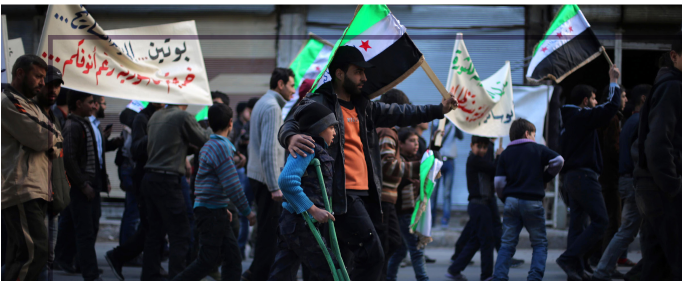
Below. Protesters hold flags and placards denouncing Russia’s role in the Syrian conflict during an anti-regime demonstration in the rebel-held town of Saqba, on the outskirts of the Syrian capital Damascus, on 16 March, 2016.

Were the US to reduce its commitment to the Middle East, the effects would be profound. After all, the United States has played the overarching security role in the Middle East for almost five decades, since the United Kingdom withdrew “East of Suez” in a fundamental re-balancing of its own global role. At that time, the United States and the United Kingdom had been close partners for much of the 20th century, fighting two world wars and prosecuting the Cold War together. When the United Kingdom concluded it could no longer afford to maintain a far-flung military empire, the transition to US leadership in the early 1970s