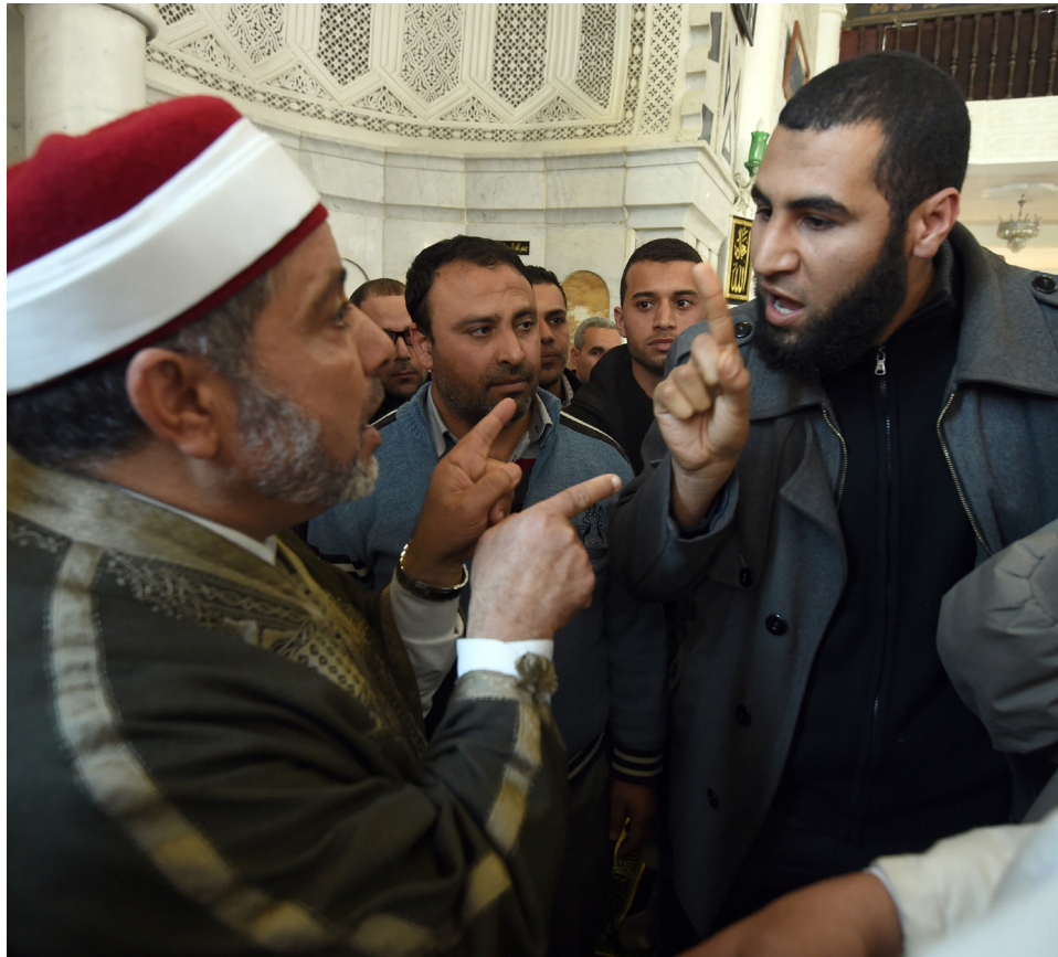
Above. Tunisian imam and former Religion Affairs minister, Nouredine Khadmi (L) argues with a salafist worshipper following the Friday prayer at al-Fath mosque on 16 January, 2015 in central Tunis.

In states like Morocco, the Islamist Parti de la Justice et du Développement (PJD) party plays a leading role in political life, controls several key ministries and regularly wins the plurality in elections. In Tunisia, by contrast, Islamists still struggle to regain the leadership role they had shortly after the government of Zine al-Abdine ben Ali fell. In Egypt, the Muslim Brotherhood remains outlawed, and the Brotherhood's Freedom and Justice Party is banned. While the United Arab Emirates has steadily increased