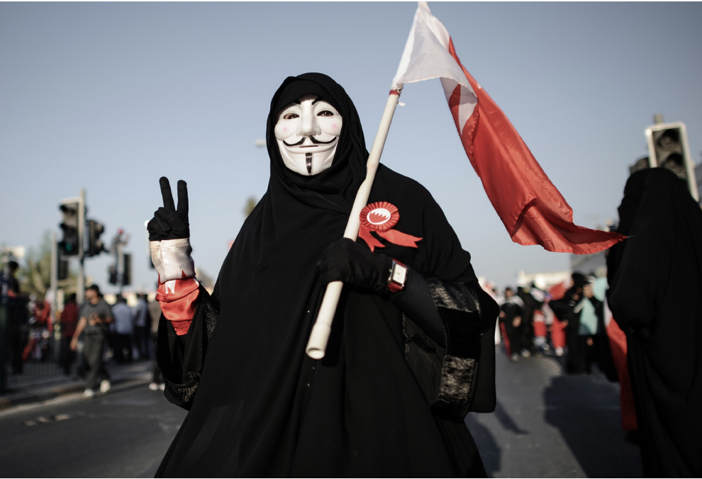
Below. 2013: A Bahraini woman wearing a Guy Fawkes mask in protest against the arrest of Khalil Marzooq.

Since so many oil producers rely so heavily on oil sales for government revenue, a dip in prices often leads to significant deficits. The numbers have often varied widely—the International Monetary Fund (IMF) estimates Algeria’s required price in 2014 at USD135.30 and Qatar’s as only USD53.50 in the same year. But