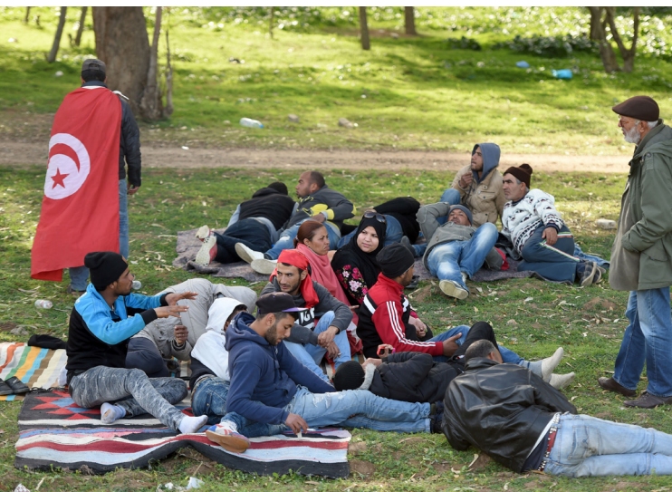
Above. Unemployed Tunisians sit in a park in Tunis after a march demanding work.