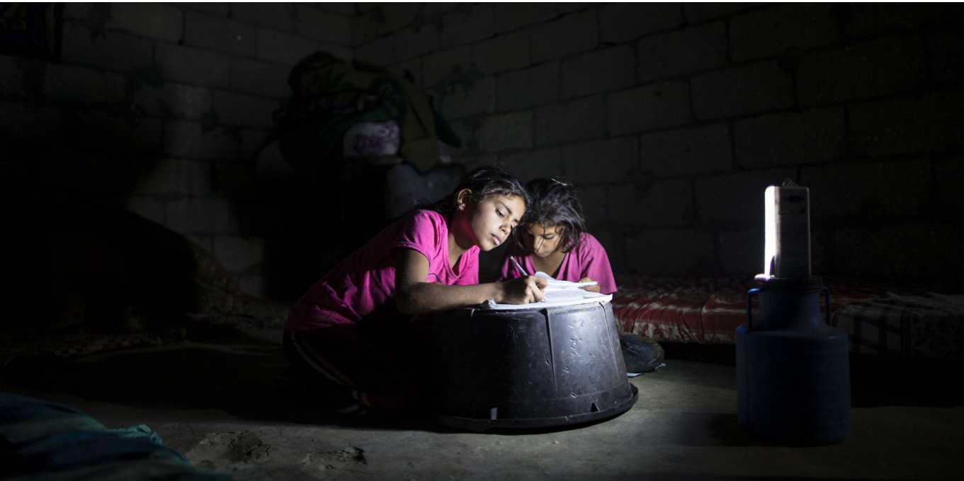
Above. Palestinian schoolgirls do their homework during a power cut in Gaza.

The Arab consensus of the 1990s and 2000s has decidedly broken, but the clean polarization of the 1950s and 1960s has not returned.