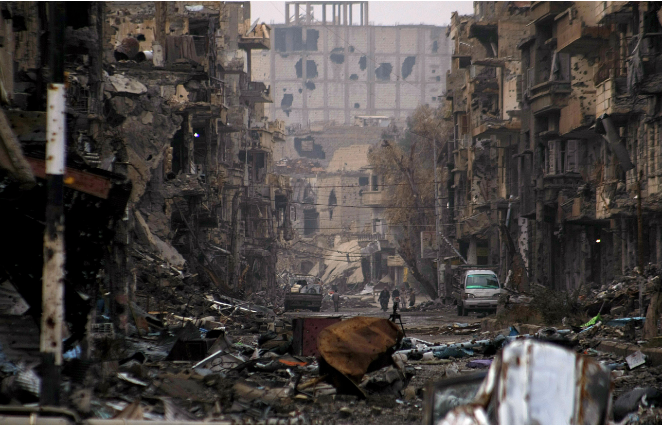
Below. Syrians walk along a severely damaged road in the northeastern city of Deir al-Zour on 4 January, 2014.

Iran in the East, home to hundreds of millions of people and much of the world's oil and gas reserves. The region had its problems, but this was before revolutions and counterrevolutions shook the Arab world, before civil wars and proxy wars pushed millions from their homes, before social media threatened to turn every computer and phone into a terrorist recruiting tool. The region's problems were acute, but they did not seem intractable.