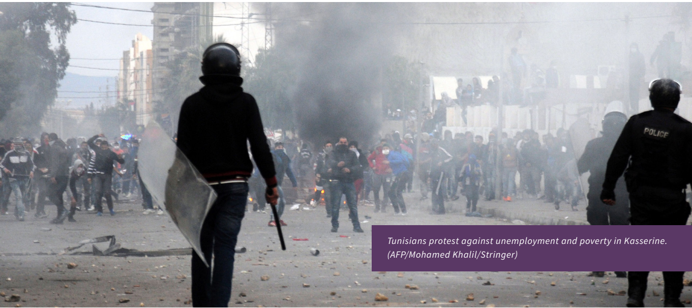
Tunisians protest against unemployment and poverty in Kasserine.

be the most difficult to deal with because it is more psychological in nature. Simply put, the region is wracked with uncertainty about how people and states will behave in the wake of the 2011 Arab uprisings, and how the rest of the world will treat the Middle East.