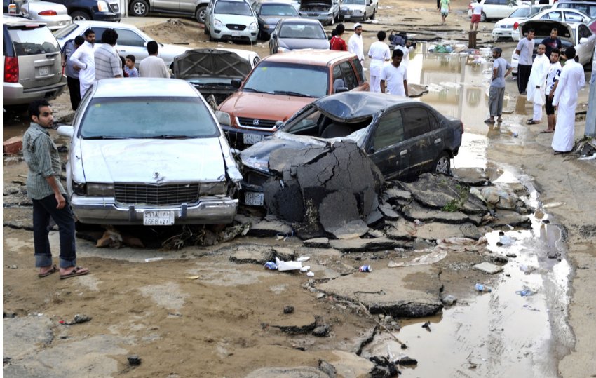
Left. Saudi government capacity was challenged after severe flooding in Jeddah in 2011 destroyed roads and other infrastructure.

300,000 teachers to educate 3.5 million primary and secondary students. Virtually all Saudis have access to drinking water and sanitation. Beyond building infrastructure, Saudi Arabia has created rules and regulations to govern a modern, USD1.6 trillion economy, built an army and an internal security apparatus.