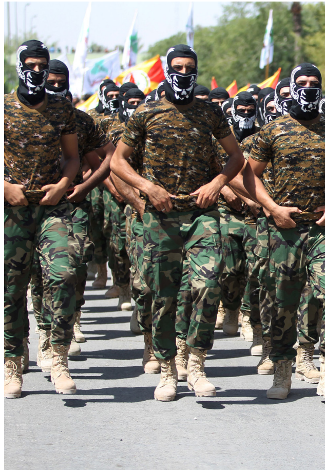
Above. Iraqi members of the powerful Iran-backed Badr Brigades take part in a parade marking al-Quds (Jerusalem) Day in the capital Baghdad, on 1 July, 2016.

has repeatedly drawn a media spotlight in Iraq, and images of Iranian clerics and pro-Iranian graffiti have consistently followed the liberation of Sunni-majority towns from Daesh rule.