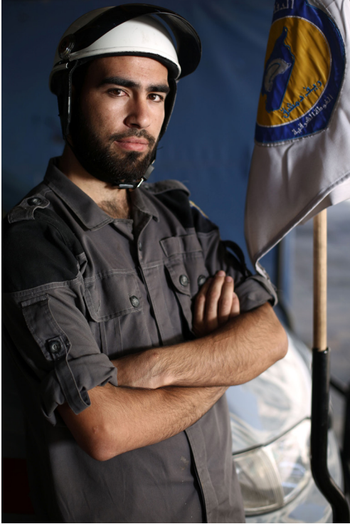
Left. A Syrian White Helmet volunteer poses in Douma, Rural Damascus.

The Middle East has several of both, and they draw volunteers from throughout the region, threatening to export problems back when fighters return home. The fallout of the Arab uprisings lingers in large clouds of uncertainty, which cause people to wonder just how durable even the fragile current environment is, and what sorts of conditions—if any—could unleash a repeat of those events. And there seems to be no relief in sight for the blight of low oil prices, which means governments must confront their manifold challenges with fewer resources than they had in years past.